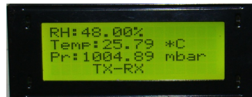
FIG. 2: The LCD Display unit is consisting of 16×4 line Alphanumeric Display. The Display unit is Back lighted for better visibility.

The parameters for the Data logger are as follows: